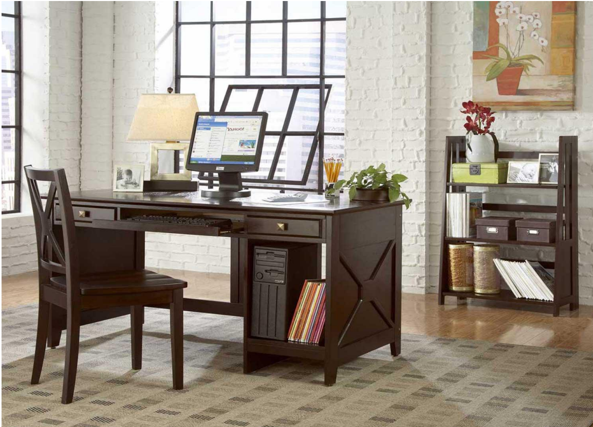
Fig 1.2a, diagram of a personal work space

A closed/Personal office is an office where each individual is given his/her separate office, it also allows you to manage your private and work life in the same place. As the name implies, it's your private, default work area. The beauty of this is that it is just you having access to your notes, tasks, and tags stored, where your notes and tasks are only visible to you. Below is a pictorial view of what a personal works space should look like