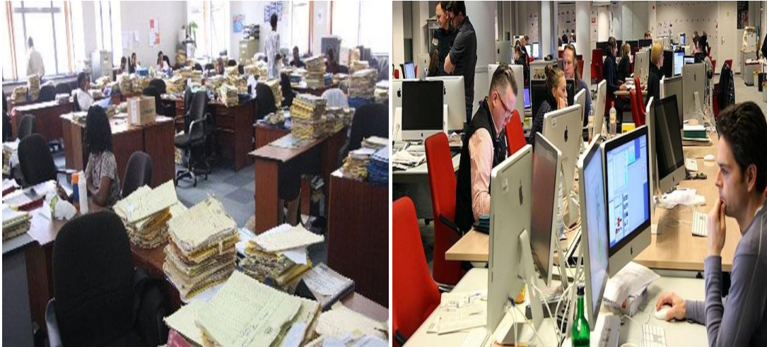
Fig3.1a, A traditional office environment Fig3.1b, A typical office environment improved by Technology

Most software and information technology companies seek to employ those having strong programming skills, system analysis, software testing skills, debugging (error detection) skills.