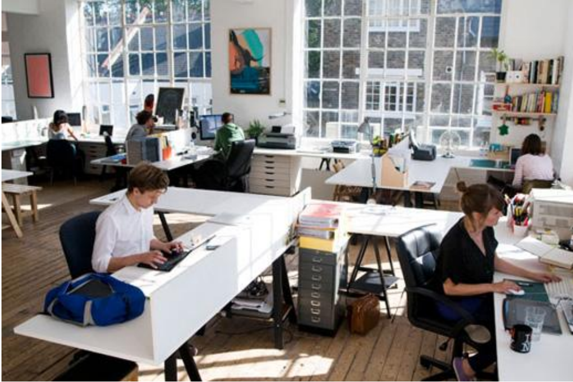
Fig1.2b:Diagram of an Open office work space