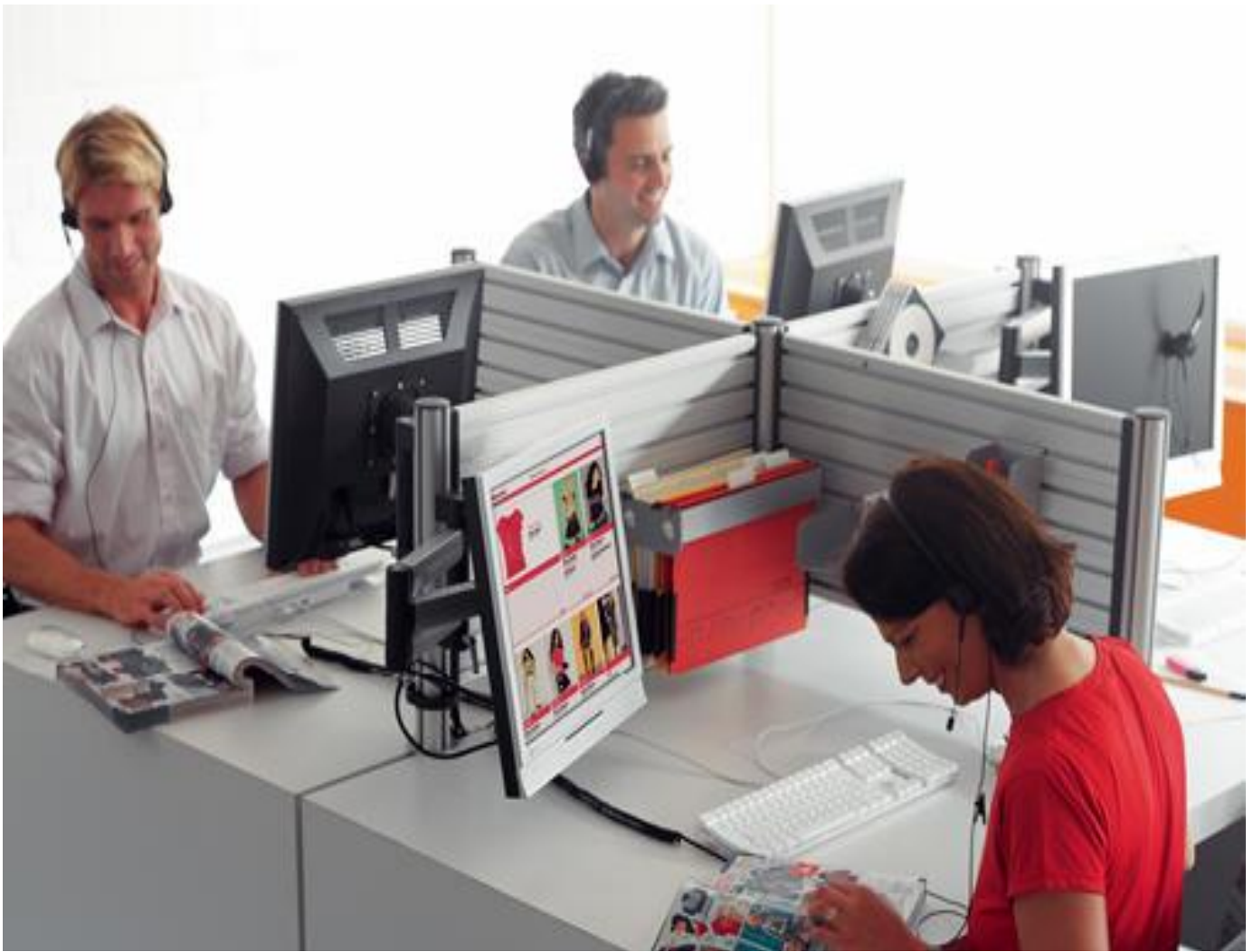
Fig1.2c: Diagram of a Cubicle work space of a business office environment Shared office work space:

It is an enclosed work space, designed for the comfort of at least two or three office staff. It is appropriate for semi-concentrated and collaborative work for very small groups. Below is a pictorial view of what a shared office work space actually looks like.