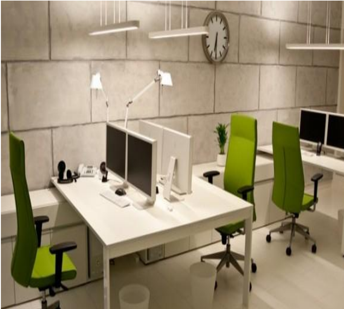
Fig1.2d: Diagram of an ideal shared work space