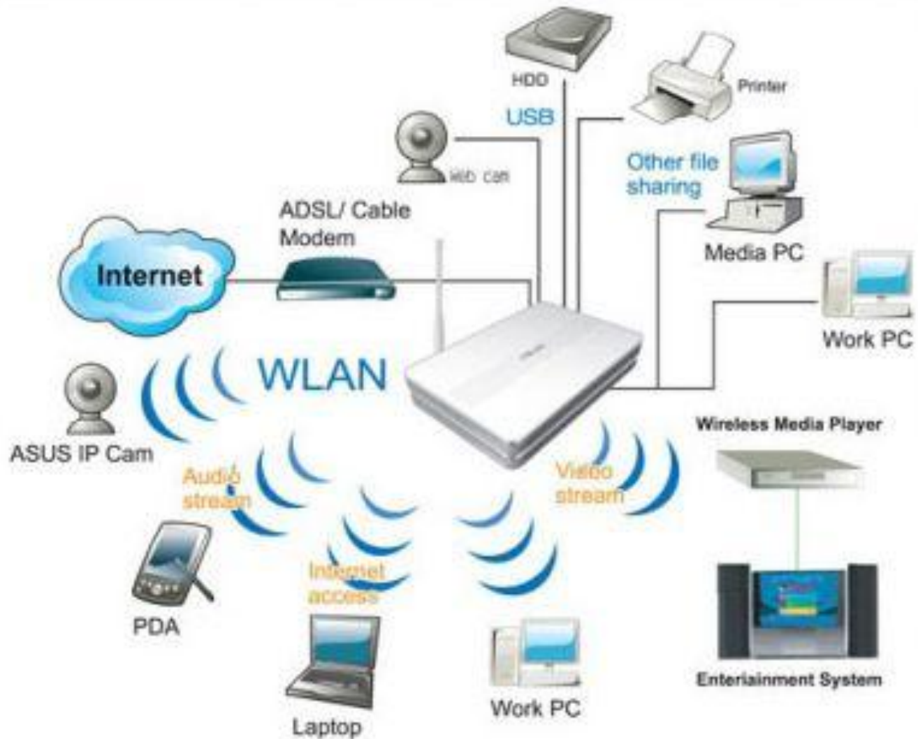
Fig: A wired and wireless network