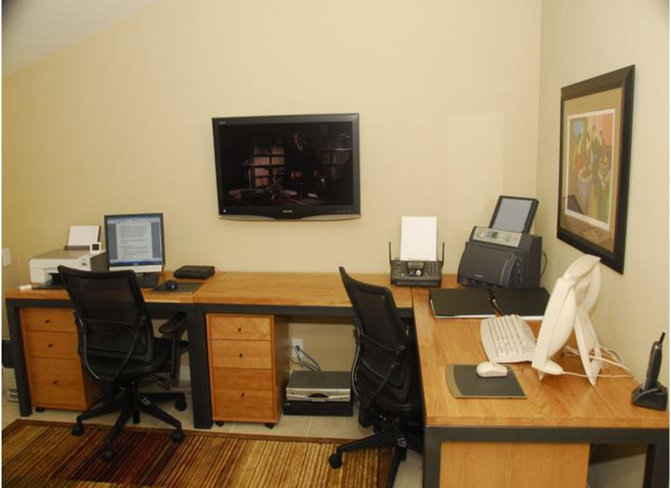
Fig3.1: A typical office environment having modern equipments

The computer scientist can describe office activities in this form