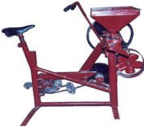
Fig. 1 An example of intermediate technology: Gym bicycle which also doubles as grinding machine

However, the use of intermediate or appropriate technology should not mean that developing countries are abandoning modern technology which is still the cheapest and most efficient way of producing large quantity of good quality products demanded by the market. Modern technology must and will continue, and it cannot be replaced by appropriate technology. Intermediate technology is a complement to modern technology, and both should exist side by side in the same society.