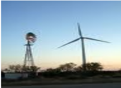
Fig. 2 showing a wind mill utilising wind as a renewable resource