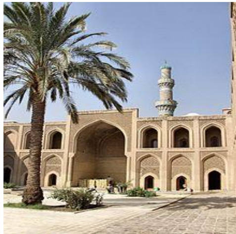
Mustansiriya University in Baghdad showing Islamic architectural design

The Umayyad mosque at Damascus and the Dome of the Rock at Jerusalem are two monumental structures depicting the beauty of Islamic architecture dating from the early Umayyad period. Other such edifices include the Khalīfah's palace known as the Golden Gate ( bāb al-dhahab ), the Green Dome ( al-qubbah al-khadra' ) which was built by the founder of Baghdad and his palace of Eternity ( qasr al-khuld ). These structures, which are designed with ovoid or elliptical domes, semicircular arches, spiral towers, indented battlements, glazed wall-tiles and metal-covered roofs, are some of the legacies left behind by the early Islamic civilization.