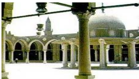
This mosque, built in Cairo by `Amr ibn al-`As, was the first mosque in Africa