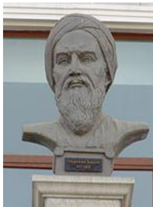
Al-Biruni's bust at an entrance to National library of Tajikistan

Abū al-Rayhān Muhammad ibn Ahmad al-Birūnī was born in September 973 C.E. in Khwarezm region of Persia. His popular name al-Birūnī which means “from the outer district” is called Alberonius in Latin and Al-Biruni in English. He was an Islamic scholar who took his fame in subjects such as Physics, Mathematics, Astronomy, and natural sciences among others. He spent many years as a scholar in Ghazni in the present day Afghanistan. In 1017 C.E. he went to live in India where he did a great job in interpreting Indian science to the Islamic world. For his scholastic achievements, he was given some titles which include “founder of Indology” (the study of India) and “first Anthropologist”. He was also given the title “al-Ustadh” (The Master) for his remarkable description of early 11 th century India. He contributed immensely to Physics by introducing the experimental scientific method to mechanics. He was also well known for his ability to combine hydrostatics with dynamics to create what is called hydrodynamics. He also devised his own method of determining the radius of the earth using observation of the height of a mountain.