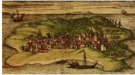
The island of Kilwa in the 15th century

rooted, as extremely beautiful, with exotic fruit, organized streets, running water, strong structures, and literacy with scholars to rival Europe.