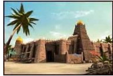
Some images of the Sankore University, Timbuktu, Mali

The University was founded in the late tenth century AD in the city of Timbuktu during the height of the Empire of Mali. The main building was located in Sankore Mosque, a spectacular pyramid-shaped work of architecture. The University was not run by any central administration. Students were not formally registered and there were no prescribed courses of study. Rather, there were different colleges each of which was independently run by a scholar. In addition to the study of Qur'an, lessons were given in science, mathematics, jurisprudence, history, astronomy and logic. There was encouragement for writing of books which was a profitable art at that time. The University thus became a center of excellence and a pride of Africa until the late 16 th century when the best of its scholars left as a result of the Moroccans' invasion of Mali.