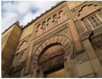
Mezquita mosque in Cordoba which was later converted into a church