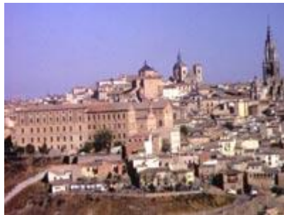
Toledo fell to Christianity in 1085

Aside the internal political wrangling among Muslims, Islamic Empire especially in Spain was greatly threatened by External aggressions from the Christian rulers. By the early eleventh century CE, Islamic empire had been shattered into small weak kingdoms each of them claiming independent authority. Consequently by 1085 CE, Toledo, which was one of the big Islamic centers, fell to Christianity.