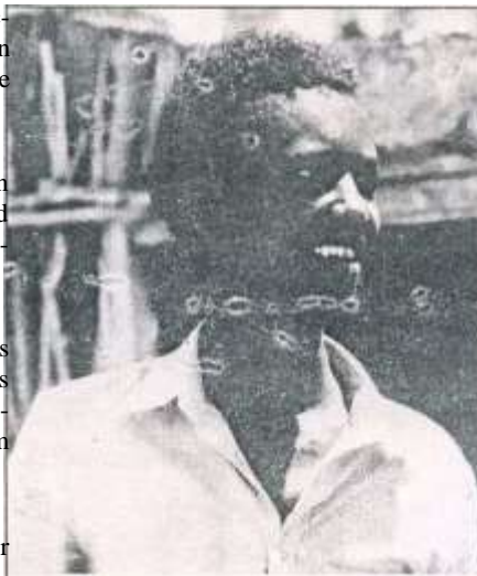
All Maow Maalin, the world's last victim of smallpox.

1958 During the Eleventh World Health Assembly, the Soviet Union points out that the funds devoted to smallpox vaccination probably exceed the cost of wiping out the disease. WHA votes to step up efforts to eradicate smallpox.